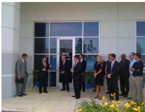
Pictured above are WPG, Desoto County Economic Council, Mississippi Development Authority, and Southaven Officials at the recent ribbon cutting.

Headquartered in San Jose, Calif., WPG Americas (WPGA) was founded in 2007 and is a franchised partner to technology